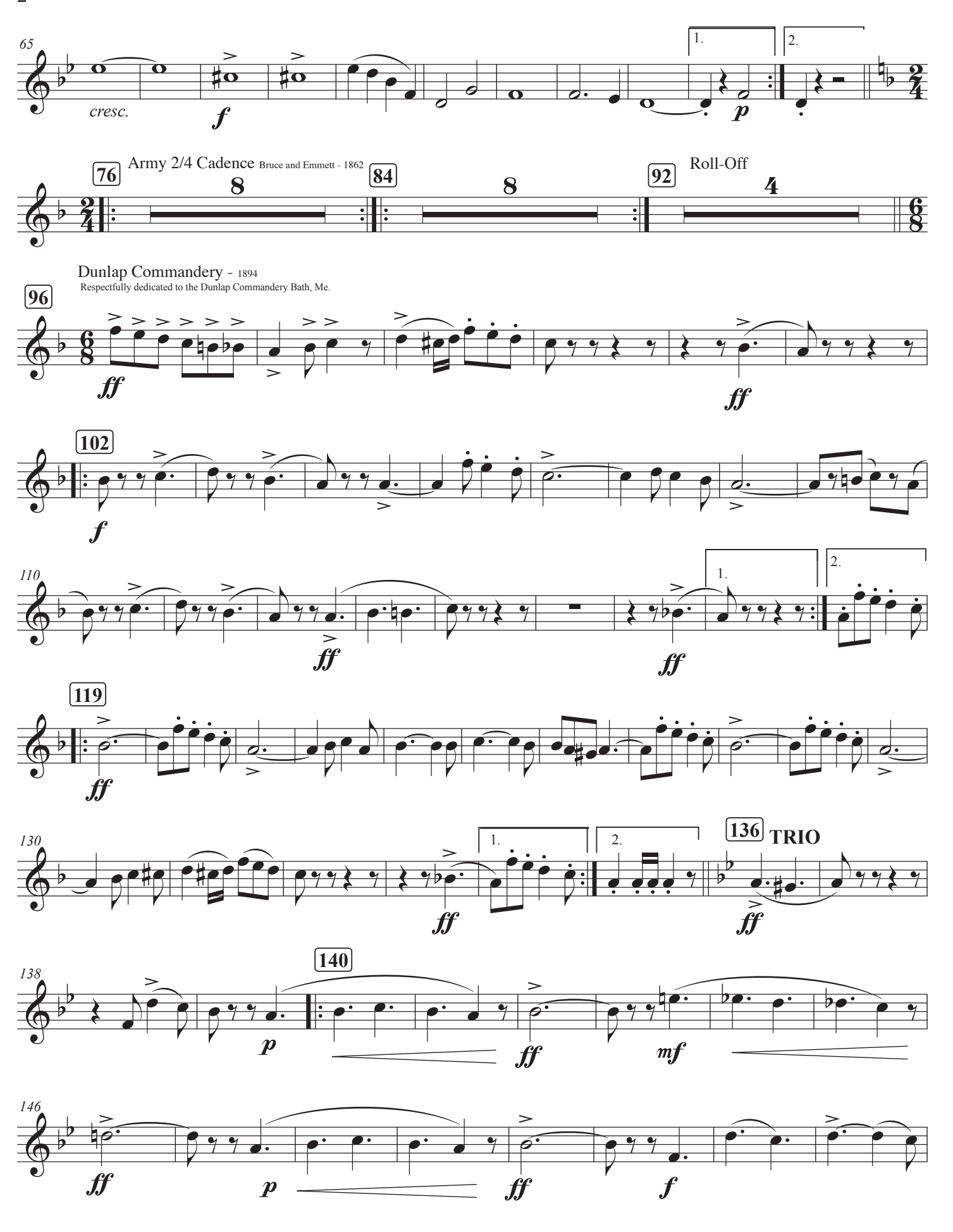
Cornet 2 p. 2